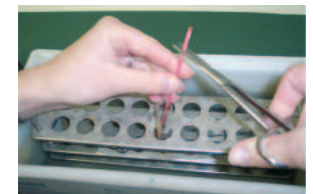
Invert the straw into a test tube at 37°C. Then cut the plugged end.

If you have any queries regarding handling the container or the straws please do not hesitate to contact us.