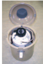
Dry Shipping Container.