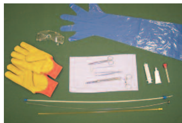
Equipment needed for thawing semen.