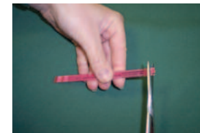
Cut sealed or crimped end.