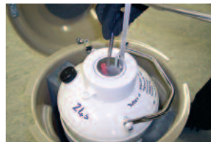
Do not lift the goblet above the neck of the canister.