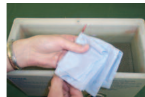
Dry the straws thoroughly.